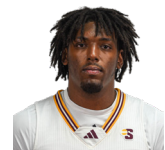
12 DOUCET Sr. ▶ Forward

MIN. 29.9 PPG 13.3 RPG 2.2 APG 3.8 FG% 51.3 3FG% 32.3